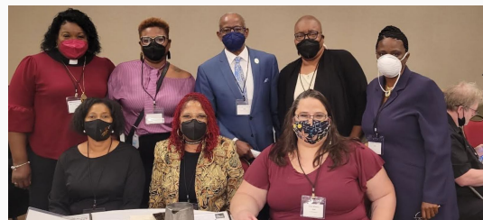
Pictured above-CAJM representatives and our newest sister organization, The Greenville Interfaith Justice Network!