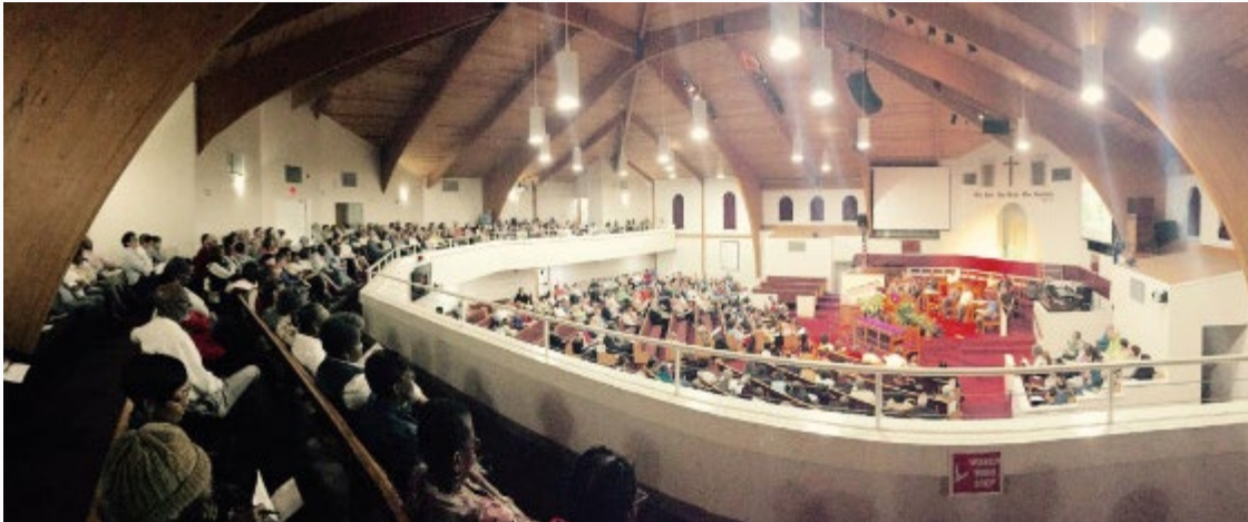
2016 CAJM Rally