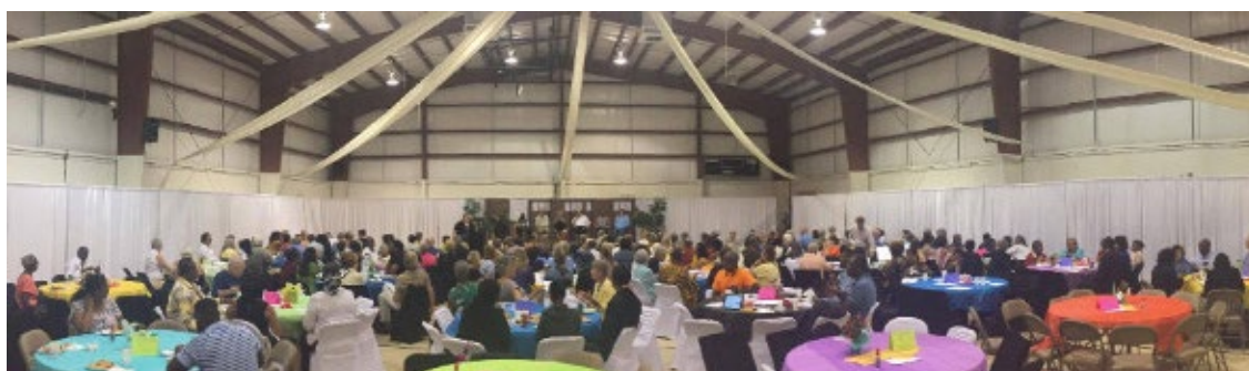
2017 CAJM Celebration