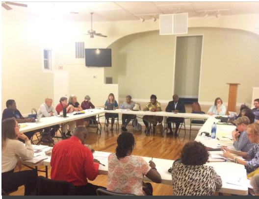
CAJM Board of Director Meeting at Charity Baptist Church.