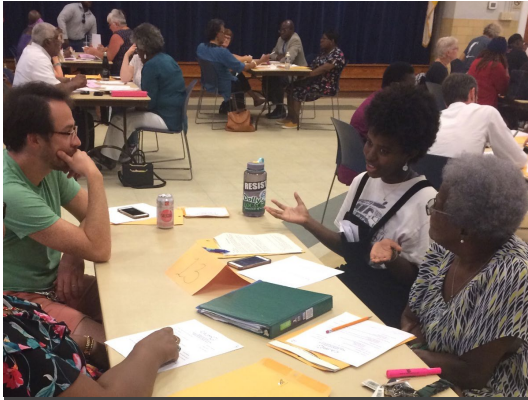
Fall house meeting training in preparation for over 100 house meeting across Charleston County.

With the holidays approaching, it's easy to believe we have down time or that there is no work to be done. These problems we face in our community will be here long after the holiday cheer has dissipated. Our children will return to schools where suspensions are used at alarming rates. North Charleston has the second highest payout rate in the State for cases against the police department and they continue to resist conducting an audit for racial bias in their police department. CARTA has not increased frequency on routes which meet the needs of our most vulnerable community members lowering the quality of living. Housing affordability is still at a crisis level with North Charleston eviction rates recently highlighted in a New York Times article .