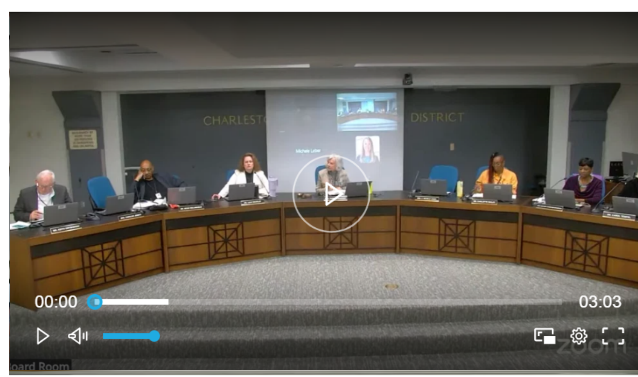
Charleston County School Board of Trustees, February 25, 2026